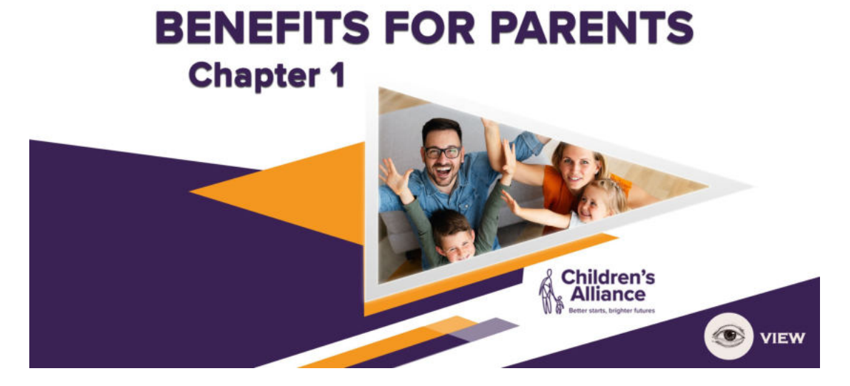
Chapter 1: Benefits for Parents

A strong national policy focus on the antenatal period and the first 1001 days of a child's life, succeeded by the early years, is perceived as integral to personal health and wellbeing, but public and policy awareness of the value of preconception care to population health and the wider economy sits firmly beneath the radar.